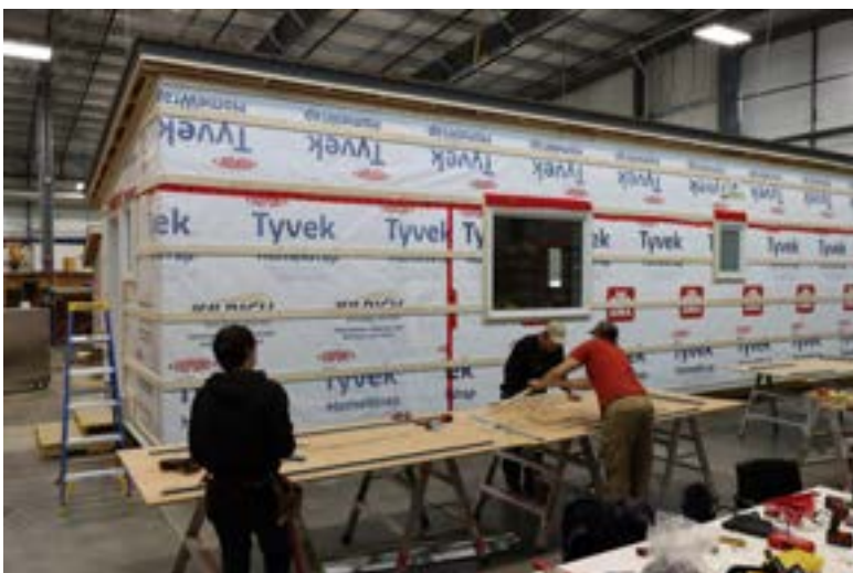
Instructor and students working on current housing project

Construction is well underway for the current Housing Maintainer project in partnership with Champagne Aishihik First Nations (CAFN). In October, work included vapour barrier and interior framing, installation of windows and exterior door, plumbing rough-in and HRV rough-in. At the start of November, the tin roofing application was finished and the students started working on window and door trim and siding application. All inspections have been passed to date.