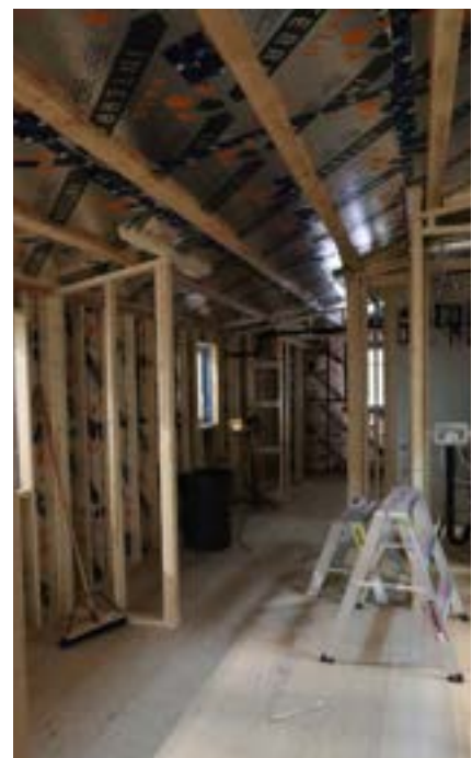
Progress to date