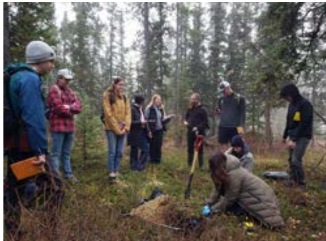
The Aurora Geosciences field crew introducing Earth Sciences students to gravity survey methods and their current investigations in the Whitehorse area.