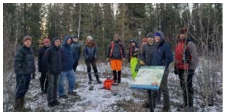
YukonU students digging soil pits and sampling soils for laboratory analysis.